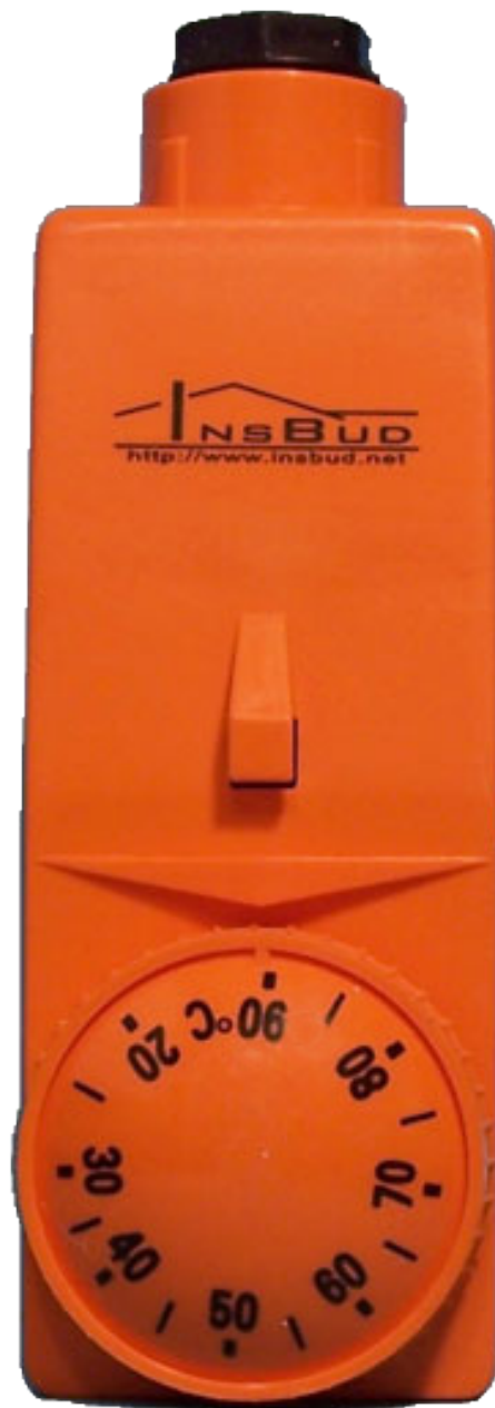
Pipe surface thermostat IB – Therm 01