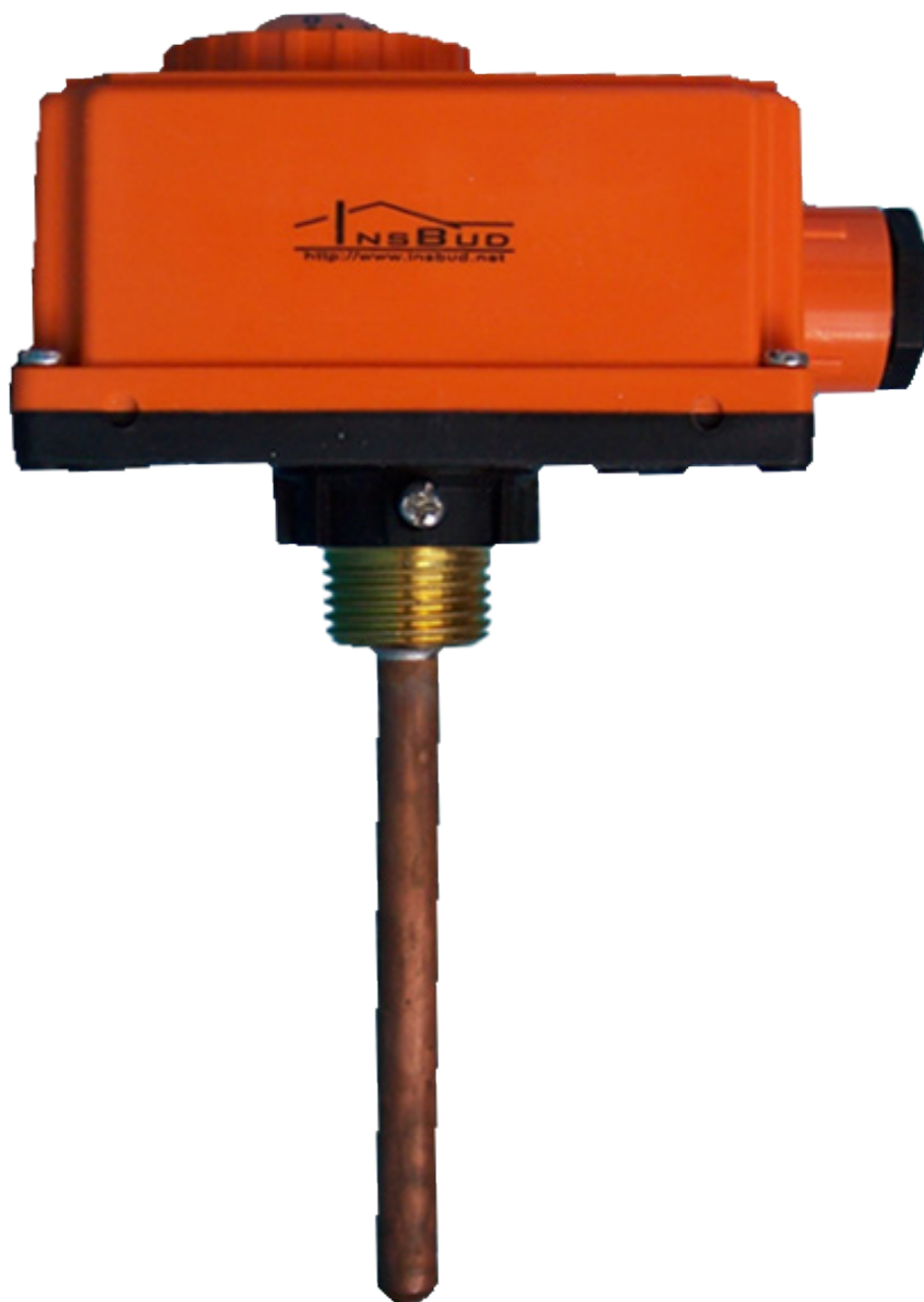
Immersion Thermostat IB – Therm 02